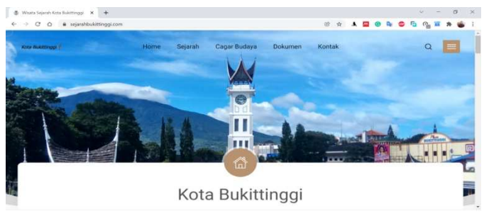
Fig. 1 Bukittingi City Historical Website

This quantitative research uses a survey approach with closed-ended questions [17], [18]. The research population is the millennial generation in Indonesia. Samples were taken with a non-probability sampling approach with purposive sampling. This study involved 831 respondents spread throughout Indonesia. Data collection techniques used in a questionnaire. At this data collection stage, before the respondents filled out the questionnaire, they first accessed the historical information about Bukittinggi, which is available on websites that can be accessed via Android and laptop. Here is one of the websites in the town of Bukittinggi in Figure 1.