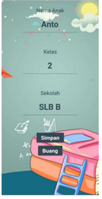
Fig. 5 Child Identity

Table III exhibits the expert assessments, with individual scores provided for reference.