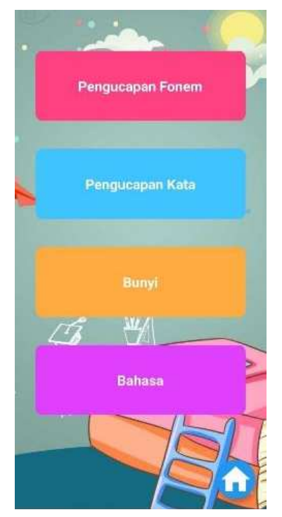
Fig. 1 The Main Menu of the Perception of Voice and Rhythm Assessment Application

Fig. 2 depicts the competency test menu, encompassing phoneme pronunciation, word pronunciation, voice, and language assessments.