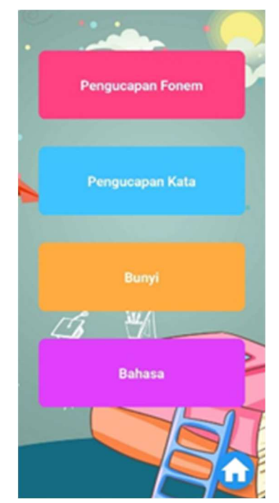
Fig. 2 Competency Test - Voice and Rhythm Perception Application

Fig. 2 depicts the competency test menu, encompassing phoneme pronunciation, word pronunciation, voice, and language assessments.